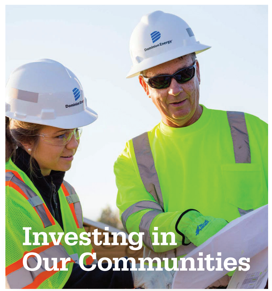
Not project specific.