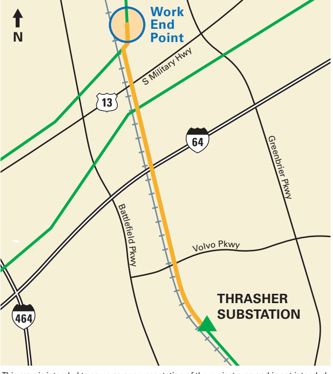
This map is intended to serve as a representation of the project area and is not intended for detailed engineering purposes.

Protecting the grid against natural and man-made acts is a top priority. Visit powerlines101.dominionenergy.com to learn more about our commitment to safety.