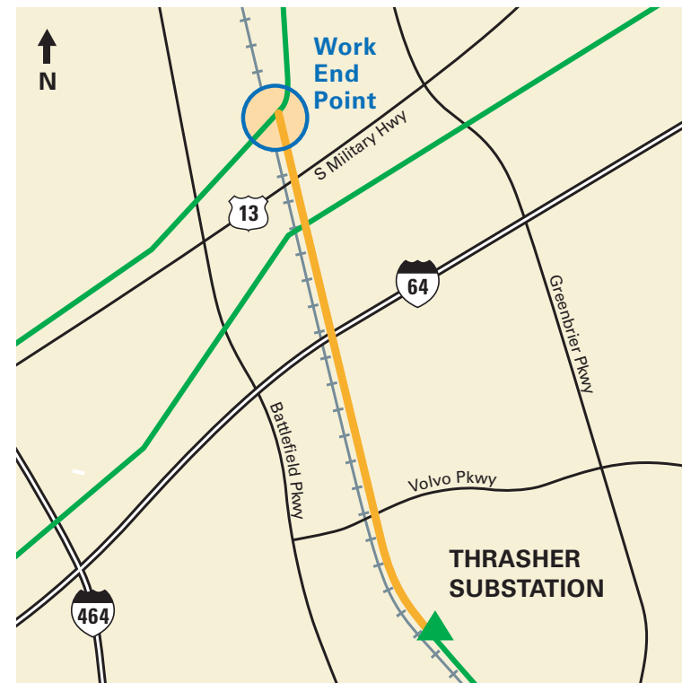
This map is intended to serve as a representation of the project area and is not intended for detailed engineering purposes.

Visit our website at powerlines101.dominionenergy.com to learn about our construction processes. Or contact us by sending an email to powerline@dominionenergy.com or calling 888-291-0190.