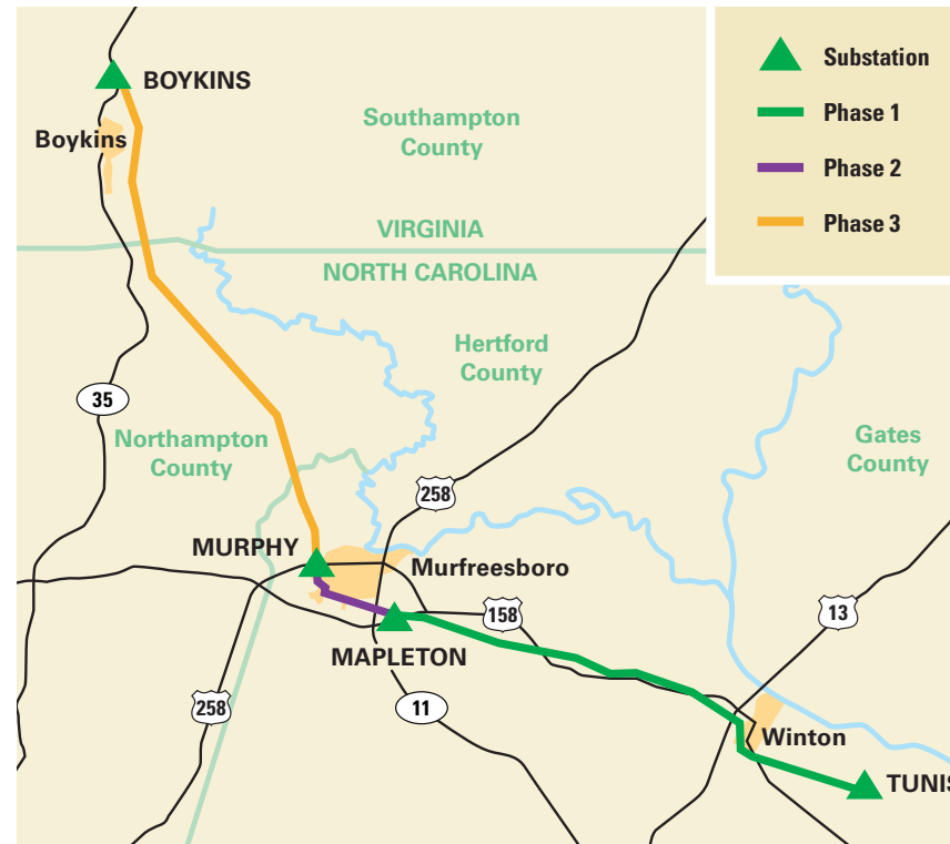
This map is intended to serve as a representation of the project area and is not intended for detailed engineering purposes.

Protecting the grid against natural and man-made acts is a top priority. You can learn more about our commitment to safety at powerlines101.dominionenergy.com .