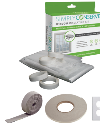
Simple Conserve® DIY Weatherization Kit