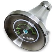
Niagara Conservation® Earth Luxe® Showerhead

Save on our Recessed and Outdoor Bundles too!