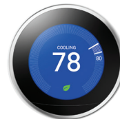
Nest Learning Thermostat®