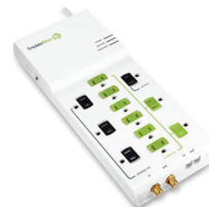
TrickleStar® Advanced Power Strip