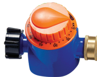
Simple Conserve® Lawn and Garden Hose Timer