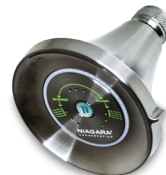
Niagara Conservation® Earth Luxe® Showerhead