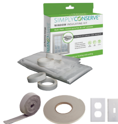
Simple Conserve® DIY Weatherization Kit