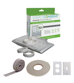
Simply Conserve® DIY Weatherization Kit