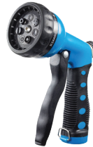
Niagara Conservation® Water-Saving 7-Spray Garden Hose Nozzle