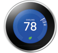
Nest Learning Thermostat®