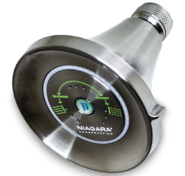
Niagara Conservation® Earth Luxe® Showerhead