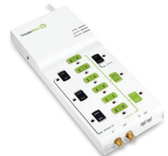
TrickleStar® Advanced Power Strip