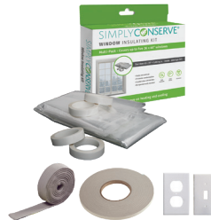
Simply Conserve® DIY Weatherization Kit