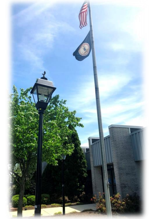
Follow on mobile: www.dominionenergy.com/LED-demo

Hours of Operation: 9 AM – 6:30 PM (Oct.-Mar.) 9 AM – 9:30 PM (Apr.-Sept.)